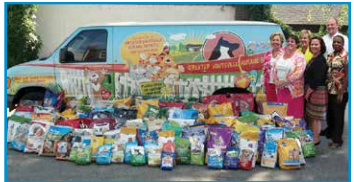
BancorpSouth met and surpassed our goal of 5000 lbs of dog and cat food to benefit Kings Community Kitchen at the Humane Society. The total amount collected was 5,301 lbs!