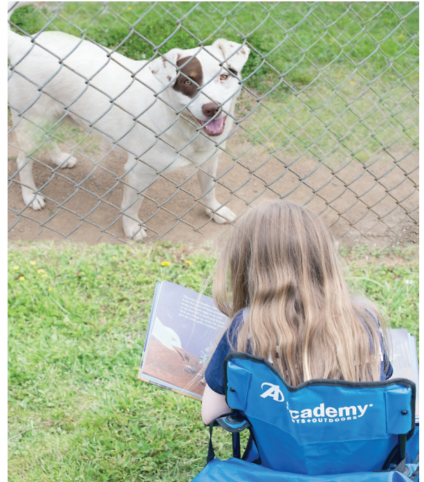
Lucky (pup) enjoys his special reading time with a Paws for Reading volunteer.

If you'd like to participate, go to ghhs.org/paws-for-reading and complete the online form. Adults are asked to attend an orientation before scheduling reading time.